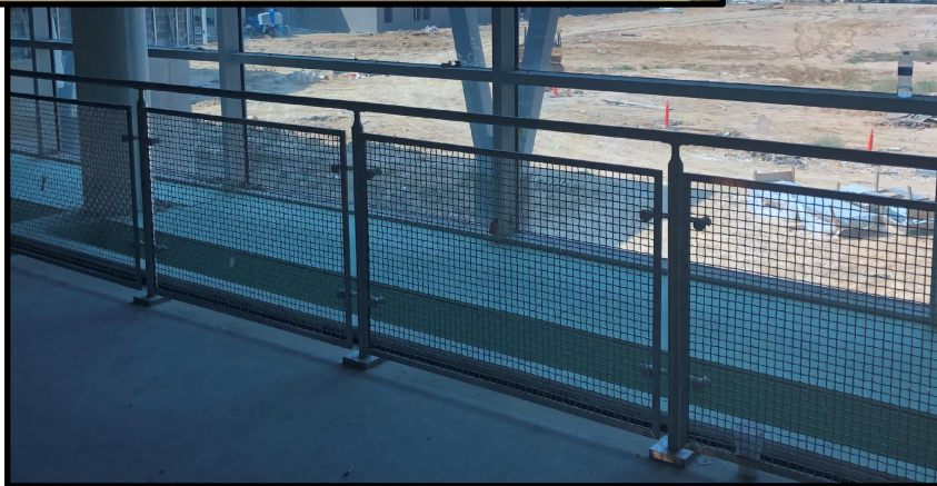
2nd Floor Guardrails